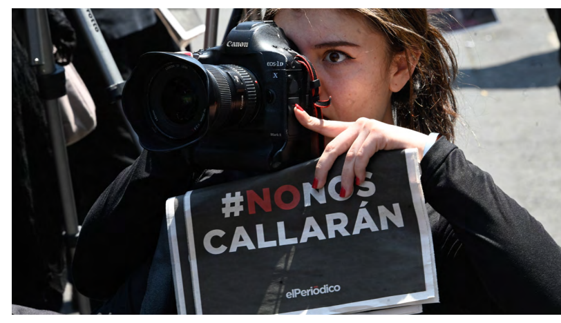
Photographer holds a sign with the hashtag #NoNosCallarán during a demonstration by journalists against the criminalization of elPeriódico staff in Guatemala City on March 4, 2023.

When Bernardo Arévalo took office as president in January 2024, he promised to return Guatemala to a democratic path, which included a commitment to implement policies to protect journalists and human rights advocates. He proposed creating a human rights directorate within the Interior Ministry to develop protocols, coordinate protection measures with other entities, and institutionalise an early warning system in cooperation with the National Civilian Police, the Public Ministry, and the judiciary. A National Council for Prevention and for the Protection of Human Rights Defenders is also planned, which will include participation from civil society.